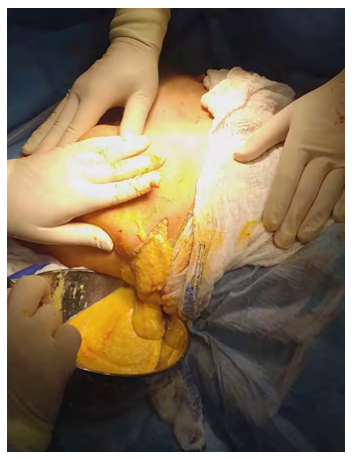
Fig. 3 Left: evacuation of approximately 350 ml putrid dense yellowish creamy fluid from each breast. Right: the mammary glands were consumed completely by the inflammatory process.

Actual Gyn 2021, 13, 43-47 www.actualgyn.com