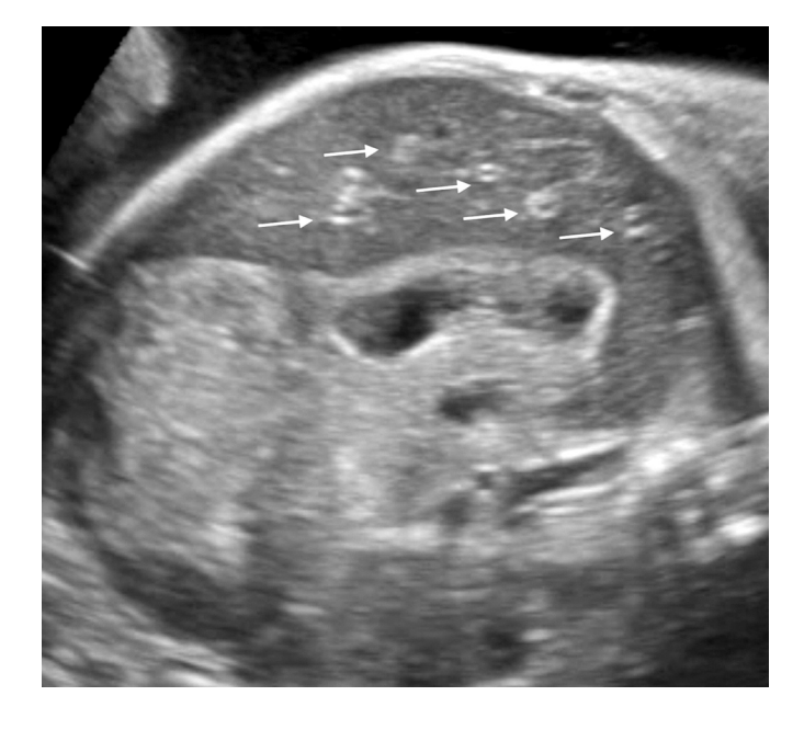
Fig. 1 Transabdominal oblique view of the fetal abdomen with typical sonographic appearance of the liver parenchyma (left lobe) with bright echogenic dots (arrows) throughout of hypoechoic liver parenchyma (starry sky appearance)