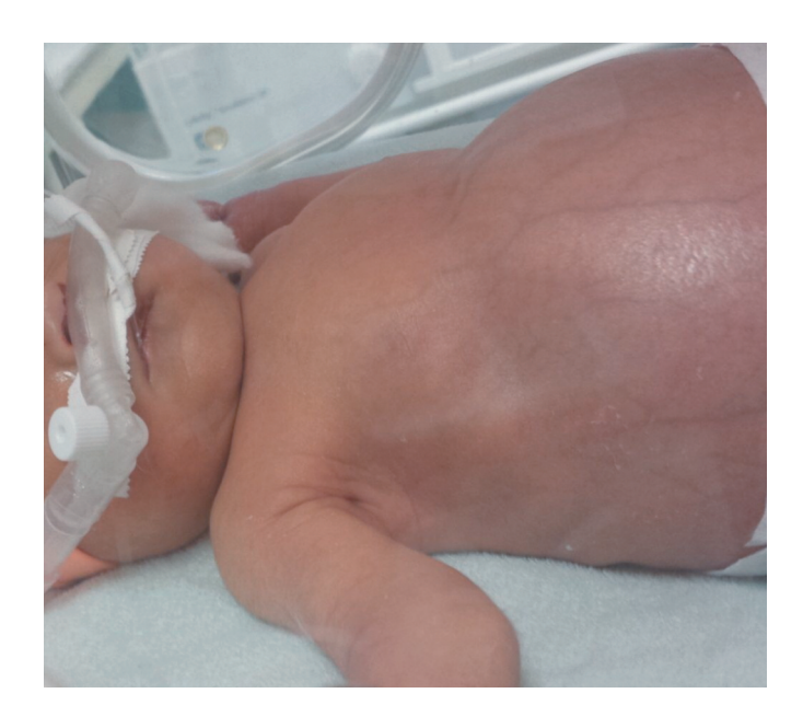
Fig. 2 Postnatal picture of the newborn with markedly enlarged abdomen (disproportion between the chest and abdomen)